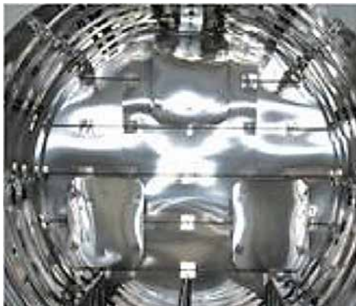
Figure 1: All-metal design hot-zone.

As graphite has emerged over the past few decades as a highly engineered material, its use in manufacturing hot zone components increased. Vacuum furnace manufacturers, using graphite, were able to change the shapes, and reduce the size and weight of the hot-zone components to increase efficiency. They also incorporated graphite hot-zone components to facilitate intricate part designs that can be manufactured quickly and reliably. Modern purification processes allow for very high purity levels to be achieved with graphite. Synthetic graphite typically has a purity level of 300-500 ppm, but