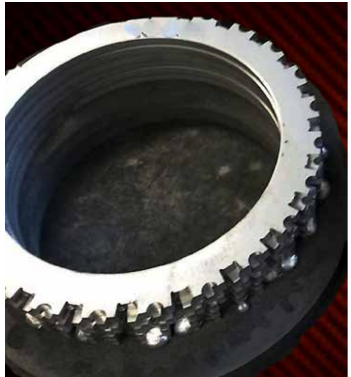
Figure 3: Eutectic bonding between stainless steel rings after processing in a belt-sintering furnace.

Another common issue encountered in heat treating metal components is eutectic melting and the role of graphite fixtures in the sintering process. Eutectic melting is the process in which an alloy of two or more metals, when heated, completely changes from solid to liquid at the same temperature. There are processes, such as brazing, where eutectic melting is a desired result. In fact, there are thousands of eutectic compositions used in brazing applications. They play a major role when heating a brazing filler metal up to the brazing temperature, as well as when cooling after brazing. During heat-up and melting, the eutectic composition will be the first to