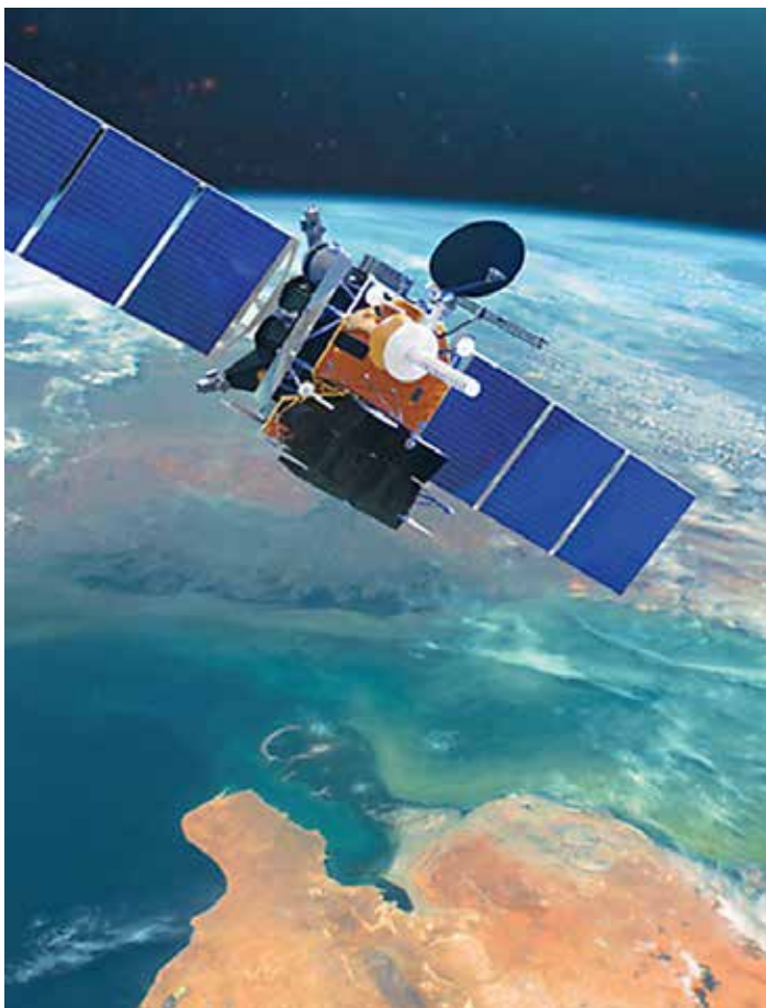
The alloy, F-11, has the potential to be used in aerospace, solar-, and nuclear-power applications.

F-11 was prepared from scratch with the six elements mixed together in the molten state in a furnace. The researchers then homogenized the alloy at 1,285°C for 12 hours followed by air cooling at an average rate of 57°C per minute to 500°C. Further study of the alloy was then made by annealing at specific temperatures.